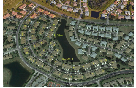
Built in 1998 - 67 units - 1 floor

Number of units: 67 Number of active listings for rent: 0 Number of active listings for sale: 1 Building inventory for sale: 1% Number of sales over the last 12 months: 4 Number of sales over the last 6 months: 3 Number of sales over the last 3 months: 1