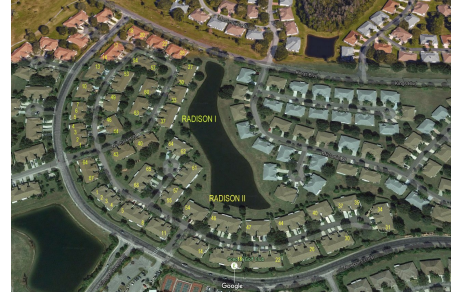
Built in 1998 - 68 units - 1 floor