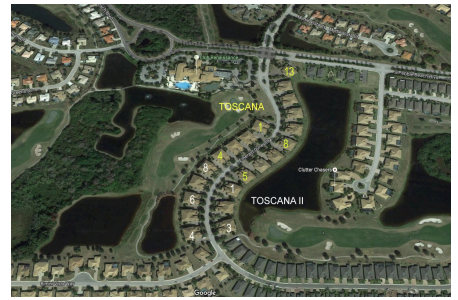
Built in 2004 - 52 units - 1 floor

1904 Clubhouse Dr Sun City Center Ph: 813-642-8790 URL: http://kpscc.com/