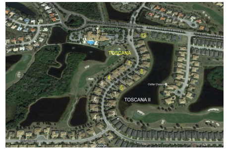
Built in 2006 - 32 units - 1 floor