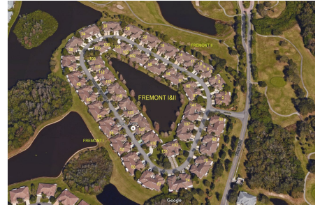
Built in 1999 - 141 units - 1 floor