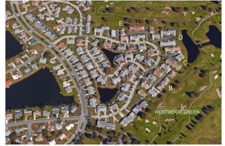
Built in 1976 - 70 units - 1 floor

Number of units: 70 Number of active listings for rent: 1 Number of active listings for sale: 10 Building inventory for sale: 14% Number of sales over the last 12 months: 7 Number of sales over the last 6 months: 3 Number of sales over the last 3 months: 3