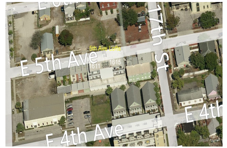
Built in 2005 - 8 units - 3 floors

Number of units: 8 Number of active listings for rent: 0 Number of active listings for sale: 0 Building inventory for sale: Number of sales over the last 12 months: 0% Number of sales over the last 6 months: 0 Number of sales over the last 3 months: 0