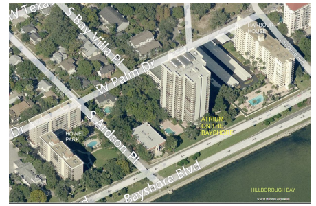
Built in 1982 - 121 units - 23 floors

THE ATRIUM ON THE BAYSHORE ASSOCIATION, INC. 3206 W DELEON ST B TAMPA FL 33609