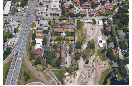
Built in 1982 - 64 units - 2 floors

Carrollwood Village Community Association Management Office: Greenacre Properties, Inc. 4131 Gunn Highway Tampa, FL 33618 (813)-600-1100 x 113