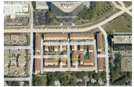
Built in 2004 - 166 units - 3 floors

CORDOBA AT BEACH PARK CONDOMINIUM ASSOCIATION, INC 114 Beach Haven Ln, Tampa, FL 33609 (813) 286-9075