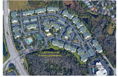
Built in 2003 - 384 units - 3 floors

Number of units: 384 Number of active listings for rent: 9 Number of active listings for sale: 7 Building inventory for sale: 1% Number of sales over the last 12 months: 13 Number of sales over the last 6 months: 7 Number of sales over the last 3 months: 1