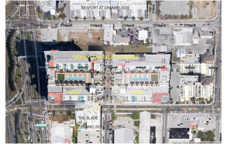
Built in 2007 - 216 units - 14 floors

Grand Central At Kennedy Association 1120 E Kennedy Blvd #208, Tampa, FL 33602 (813) 226-0991 http://grandcentralatkennedy.com/