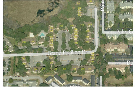
Built in 1984 - 264 units - 2 floors