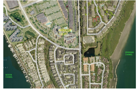
Built in 1987 - 128 units - 7 floors

Harbour Court Condominium Association 1002 S Harbour Island Blvd, Tampa, FL 33602 (813) 221-4143