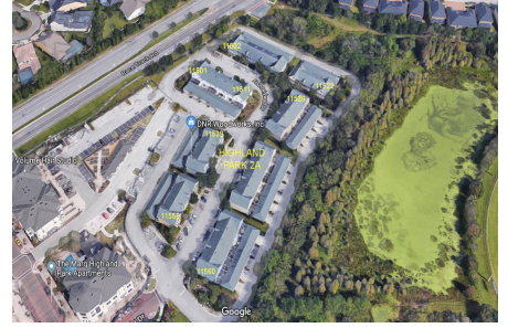
Built in 2012 - 40 units - 2 floors

Highland Park Neighborhood Association 4131 Gunn Highway Tampa, FL 33618 Phone: (813) 969-1857