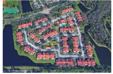
Built in 1992 - 272 units - 2 floors

Hunter's Green Community Association Address: 9456 Highland Oak Dr, Tampa, FL 33647 Phone: +1 813-991-4818 813-973-1313 Self Managed by Highlands Neighborhood Association Phone 813-428-5920