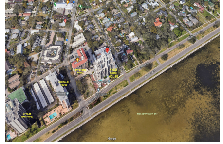
Built in 2022 - 70 units - 22 floors

Hyde Park House Address: 2103 Bayshore Blvd, Tampa, FL 33606, Phone: +1 813-861-2760