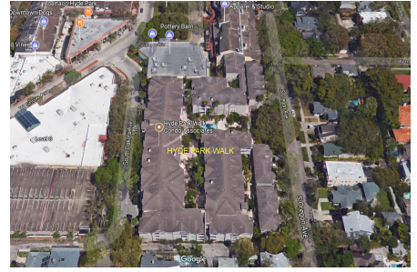
Built in 1996 - 134 units - 4 floors