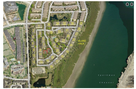
Built in 1991 - 272 units - 2 floors

ISLAND WALK CONDOMINIUM ASSOCIATION, INC. KRAMER TRIAD MANAGEMENT 3050 HORSESHOE DR N STE 275 NAPLES FL 34104 PHONE 239-263-1577