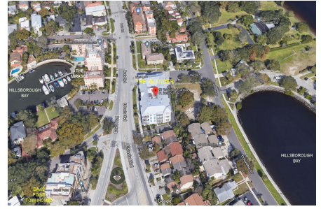
Built in 2019 - 11 units - 4 floors

THE ISLANDER CONDOMINIUM ASSOCIATION OF TAMPA, INC. 91 Davis Blvd. Tampa, FL33606