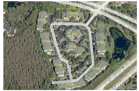
Built in 2004 - 248 units - 3 floors

Number of units: 248 Number of active listings for rent: 4 Number of active listings for sale: 6 Building inventory for sale: 2% Number of sales over the last 12 months: 19 Number of sales over the last 6 months: 7 Number of sales over the last 3 months: 2