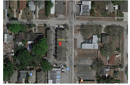
Built in 1985 - 20 units - 2 floors