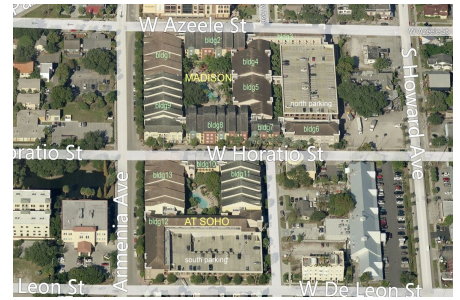
Built in 2001 - 368 units - 3 floors

THE MADISON AT SOHO II CONDOMINIUM ASSOCIATION, INC (813) 251-9500 http://www.soho2.org/