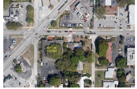
Built in 1973 - 31 units - 2 floors

NEPTUNE GARDENS CONDOMINIUM ASSOCIATION, INC 813 289 0651