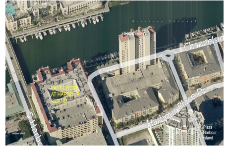
Built in 2005 - 334 units - 9 floors

Parkcrest HarbourIsland Property Manager 700 South Harbour Island Blvd Tampa, FL 33602 P 813-229-2500 F 813-229-2505 http://www.continentalconnect.com/parkcrestharbourisland