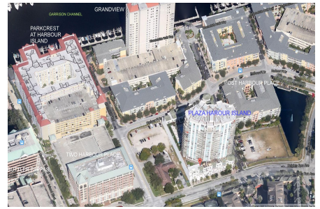
Built in 2009 - 141 units - 21 floors

Plaza Harbour Island Condominium Association Inc 450 Run Ave Tampa, FL 33602-3360 (813) 226-8585