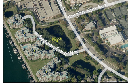
Built in 1987 - 70 units - 4 floors

SEDDON COVE CONDOMINIUM ASSOCIATION, INC. LELAND MANAGEMENT INC PHONE 407-447-9955 FAX 407-447-9899