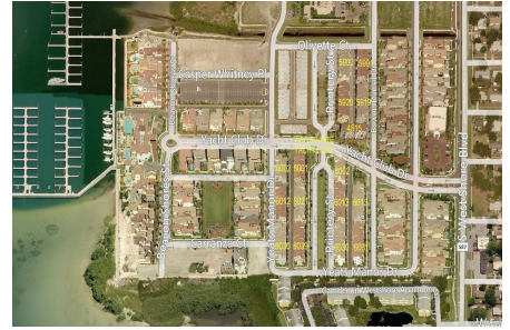
Built in 2007 - 119 units - 4 floors

Westshore Yacht Club Master Association, Inc. c/o Castle Management, LLC 6003 Beacon Shores Street Tampa, Florida 33616 Phone: (813) 831-1800 Fax: (813) 831-1822 http://www.westshore-yachtclub.net/page/19895~295724/Management-Contacts