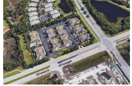
Built in 2005 - 72 units - 2 floors

Courtyards At Willoughby Condo Assn Inc 1551 Se Pomeroy St Stuart, FL 34997 Phone: (772) 219-9276