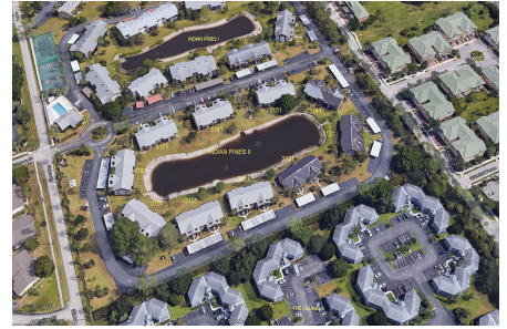
Built in 1985 - 80 units - 2 floors

Indian Pines Condominium Eight Association Inc 3011 SE Aster Lane Apartment 801 Stuart, FL 34994 (772) 287-8080