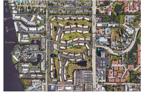
Built in 1971 - 510 units - 2 floors

King Mountain Condominium Association 1991 SW Palm City Rd, Stuart, FL 34994 (772) 283-8963