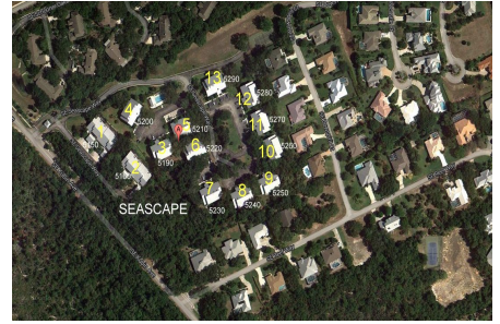
Built in 1985 - 50 units - 2 floors

Seascape Condominium Association Inc 5148 SE Seascape Way Stuart, Florida 34997-2525 SEASCAPE CONDOMINIUM ASSOCIATION INC 969 SE FEDERAL HWY, STE 401 STUART, FL 34994-3716