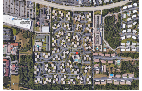
Built in 1970 - 522 units - 2 floors

Vista Pines Condominium Association Address: 2600 SE Ocean Blvd, Stuart, FL 34996 Phone: +1 772-283-4198 https://www.vistapines.com/