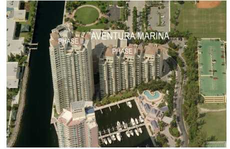
Built in 2005 - 126 units - 17 floors

Aventura Marina One Condominium Association Inc 305-705-1499