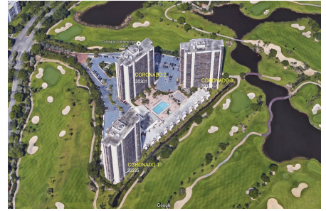
Built in 1975 - 272 units - 27 floors

Coronado Condominium Association 20301 W Country Club Dr Aventura, FL 33180 Phone number (305) 931-5900 http://csimsi.ahn01.com/coronadofl/outside_home.asp