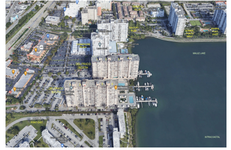
Built in 1971 - 313 units - 20 floors

Plaza Del Prado Condominium Association Address: 18071 Biscayne Blvd, Aventura, FL 33160 Phone: +1 305-931-5643 Plaza Del Prado Condominium Association 18071 Biscayne Blvd Aventura, FL 33160 (305) 682-7952 +1 305-931-3544