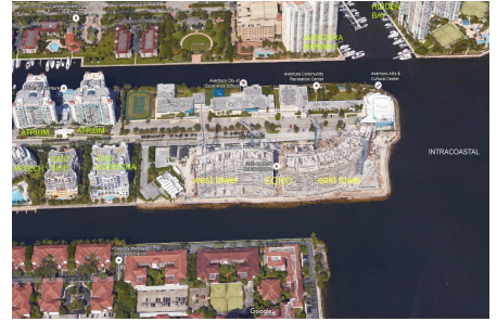
Built in 2015 - 190 units - 11 floors

Echo Aventura Address: #305, 3250 NE 188th St, Aventura, FL 33180 Phone: 786-383-1553