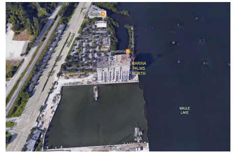
Built in 2015 - 234 units - 25 floors

Marina Palms Yacht Club & Residences Address: 17201 Biscayne Blvd, North Miami Beach, FL 33160 Phone: +1 786-629-9670