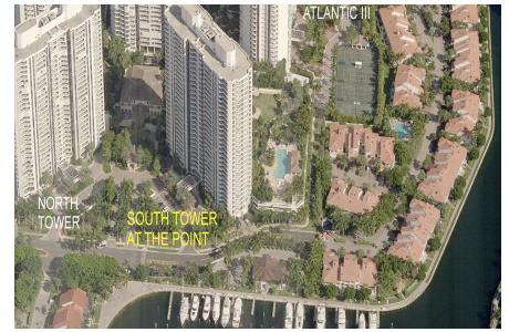
Built in 2002 - 288 units - 31 floors

South Tower At The Point Condominium Association Inc (305) 936-1555