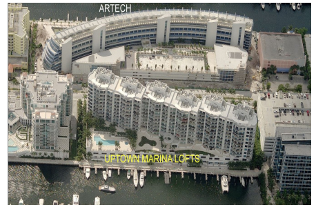
Built in 2006 - 216 units - 11 floors

Uptown Marina Lofts Condominium Association inc (305) 936-0260 & (305) 936-0015 http://www.uptownmarinalofts.net/Management-Contacts~370266~22867.htm