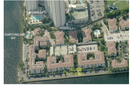
Built in 1997 - 373 units - 5 floors

Village by The Bay Condo Association (305) 935-4472