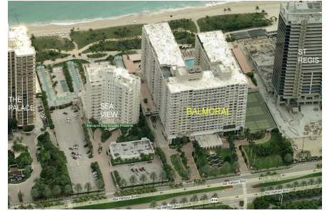
Built in 1977 - 423 units - 20 floors

Balmoral Balmoral Condominium Association Incorporated 305-866-7792 http://balmoralcondos.org