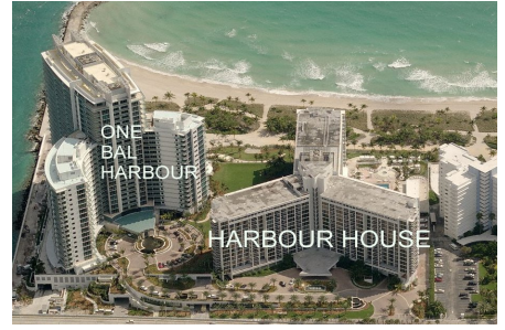
Built in 1984/2007 - 451 units - 15 floors