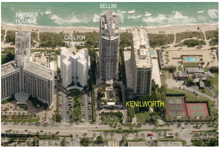
Built in 1975 - 151 units - 17 floors