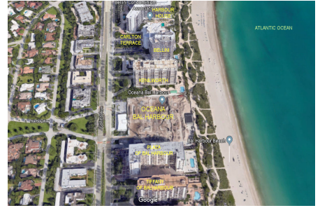
Built in 2016 - 240 units - 28 floors

Oceana Bal Harbour Address: 10201 Collins Ave, Bal Harbour, FL 33154 Phone: +1 786-414-2929 http://www.oceanabalharbour.com/