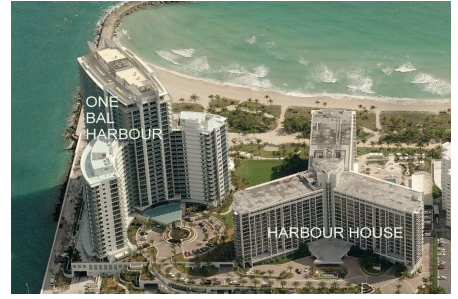
Built in 2007 - 309 units - 25 floors

One Bal Harbour 10275 Collins Ave, Bal Harbour, FL33154 (305) 865-4700