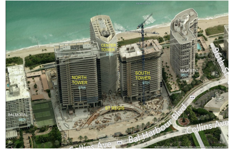
Built in 2013 - 269 units - 27 floors

The St. Regis Bal Harbour Resort Address: 9703 Collins Ave, Bal Harbour, FL 33154 Phone:(305) 993-3300