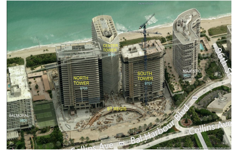
Built in 2011 - 108 units - 27 floors

St Regis Condominium Association 9500 W Bay Harbor Dr Bay Harbor Islands, FL 33154 (305) 864-1084