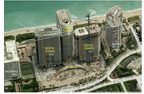
Built in 2011 - 97 units - 27 floors

St Regis Condominium Association 9500 W Bay Harbor Dr Bay Harbor Islands, FL 33154 (305) 864-1084