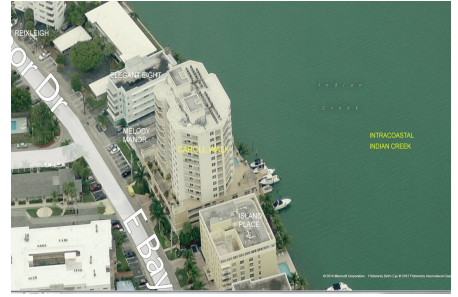
Built in 2003 - 39 units - 16 floors

Carroll Walk Condominium Assn Inc 9751 East Bay Harbor Drive Bay Harbor Islands, FL 33154 Phone: (305) 962-7000 Phone: (305) 868-3155